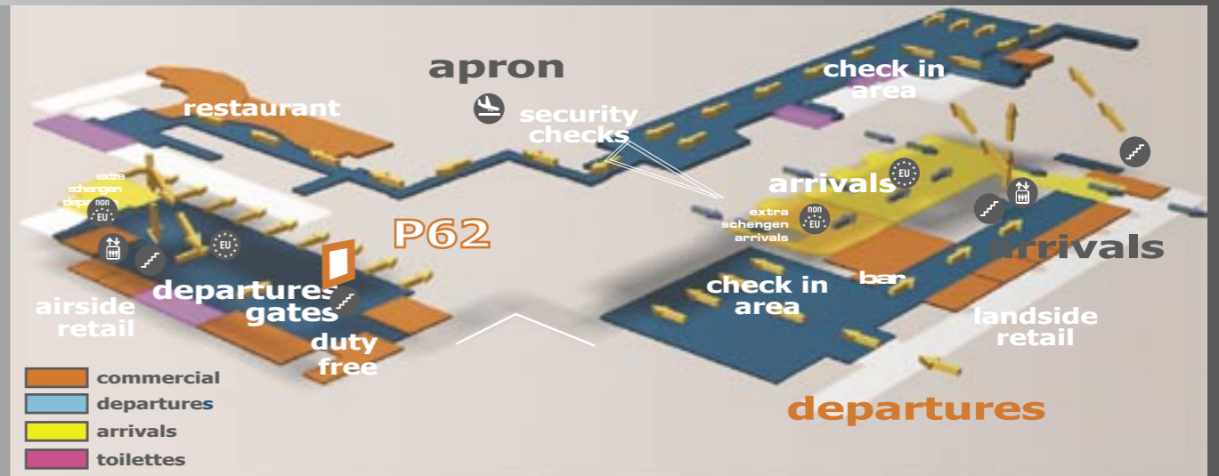
flow scheme departures/arrivals

in front of passengers flows descending first floor